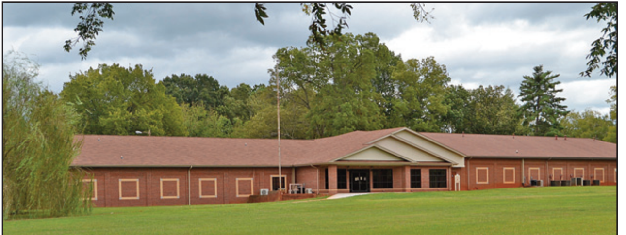
Those wanting to visit the Cherokee County History and Arts Museum can now do so virtually. Below is one of the selected artifacts highlighted on the virtual reality tour

"Limestone College has clearly messaged that they